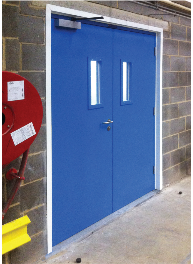
Newly installed ExecDoor® 2 double doorset specified with vision panels

Sunray's Installation Service is certified by the LPCB/BRE to LPS 1271 for security doors.