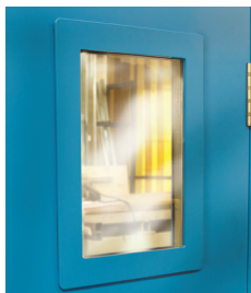
ExcluGlass® 2 rated vision panel.