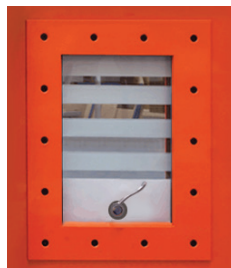
Optional Vistamatic Sherman vision panel.