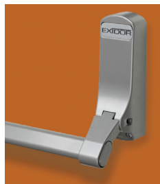
Panic escape push bar option.