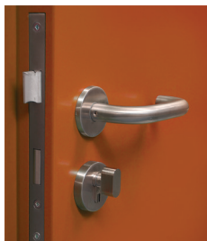
Key driven option with thumbturn.