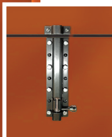
Heavy duty barrel bolt.