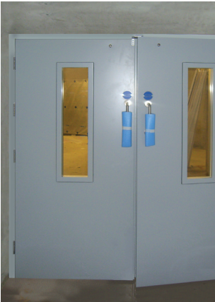
Newly fitted double SaverDoor® with vision panels.