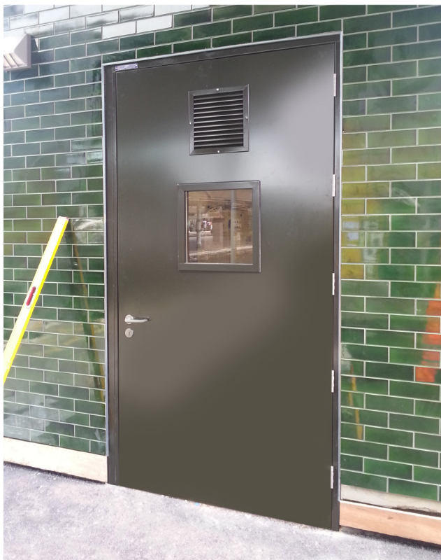
Extra wide SaverDoor® with square vision panel and ventilated panel.