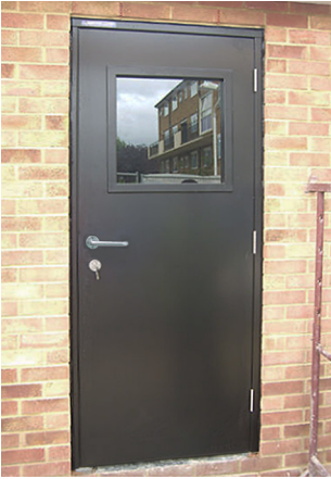
SaverDoor® with vision panel.