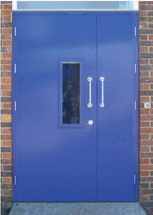
Newly installed leaf-and-a-half SaverDoor® fitted with pull handle on both leaves.